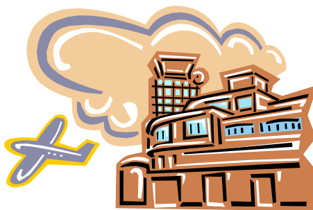
Planning a Vacation? Know your rights.

When do missing bags become lost bags? Different airlines have different rules of thumb for this, and it depends on your itinerary and just how complicatedly the bags may get misrouted. It will almost certainly take more than a week for your bags to be deemed lost, perhaps as much as a month. The