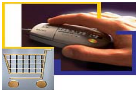
Shopping online? Know your rights.