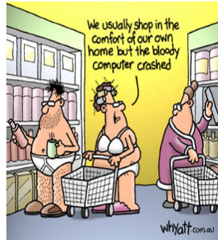
Privacy & Security on the Internet

Keep Your Passwords Private. Most reputable e-commerce websites require the shopper to log-in before placing or viewing an order. The shopper is usually required to provide a username and password. Never reveal you pass-