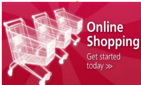
Pay Attention to Shipping Facts

Under the law, a company must ship your order within the time stated in its ad. If no time frame is stated, the merchant must ship the product in 30 days or give you